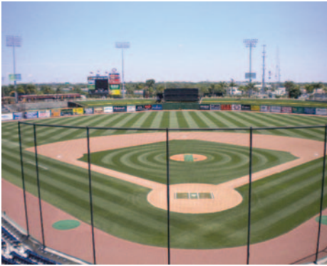
» BRIGHT HOUSE FIELD , home to the Clearwater Threshers, maintained by Opie Cheek.

ning start on pulling off the tarp, which gets the water moving and we dump it in the outfield. Then we put it back on the infield before folding it up.