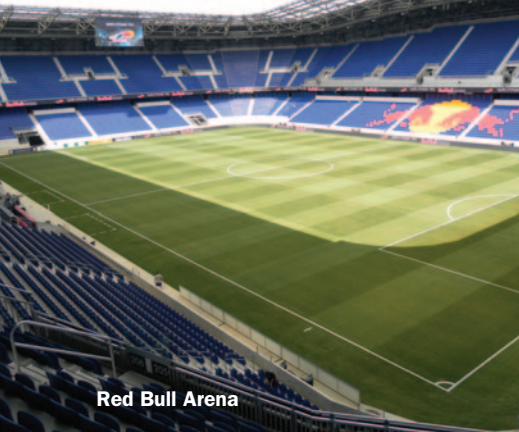
Red Bull Arena