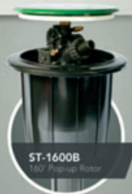
ST-1600B 160' Pop-up Rotor