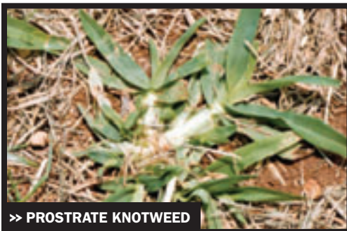
>> PROSTRATE KNOTWEED