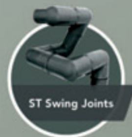
ST Swing Joints