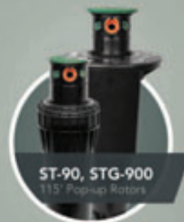
ST-90, STG-900 115' Pop-up Rotors