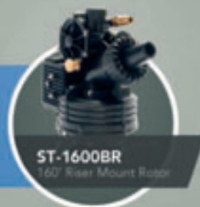
ST-1600BR 160' Riser Mount Rotor