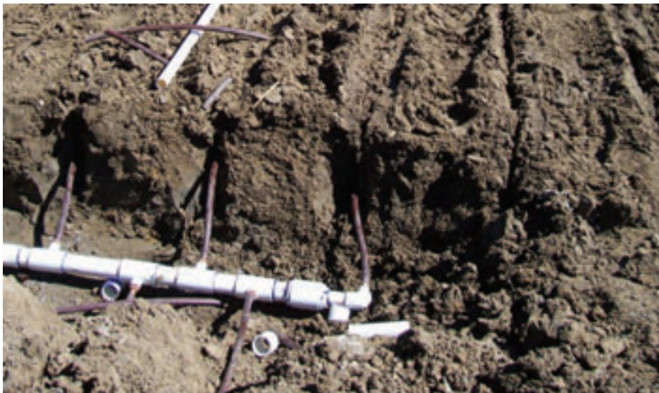
➤ NETAFIM TECHLINE CV DRIPLINE was run in lateral rows with approximately 14 inches between each line of tubing. The tubing was set in place with an automated Vermeer insertion plow.

head sprinklers. The comparison was done in May, a high usage month.