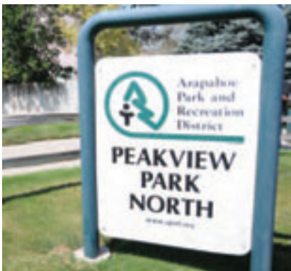
>> Bottom Right: THE ARAPAHOE PARK AND REC DISTRICT has 100 acres of developed parks, including playgrounds alongside the sports fields.