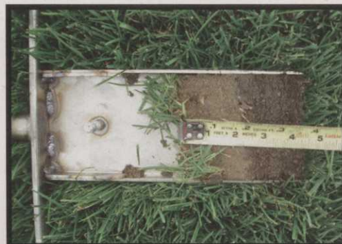
>> Above: TWO INCHES of sand topdressing accumulated on a native soil athletic field over two consecutive growing seasons.