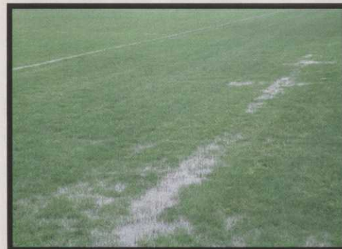
>> Above: STANDING WATER ACCUMULATES on the sidelines of a well-managed athletic field without drain tiles despite a significant sand layer developed from frequent topdressing applications.