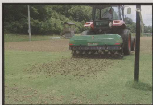
>> CORE CULTIVATION (above) coupled with sand topdressing ( below ) is a common practices for alleviating surface compaction and improve drainage.