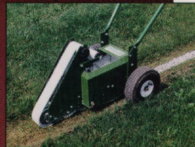
WET LINER: MODEL NO. B-WLM-234

The Bannerman WetLiner is a simple, practical tool for line marking of turf surfaces. Other wet liners spray, while our WetLiner paints each blade of grass to the ground for solid, longer lasting lines. Paint saver roller is available as an option.