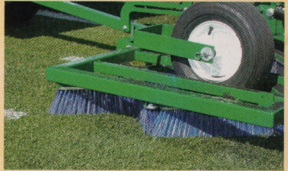
Synthetic Super Duty Blue Brushes Resist wear and will not deteriorate from moisture.