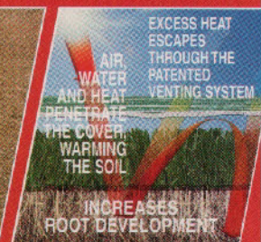
It works on the greenhouse principle, every time!