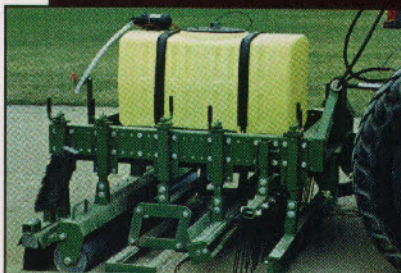
DIAMOND MASTER: MODEL NO. B-DM-6