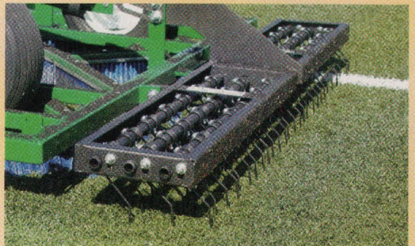
GreensSlicer Spring Tine Rake 3 rows of 28 tines.