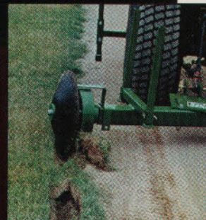
DIAMOND EDGER: MODEL NO. B-DE-20

With its adjustable guide shoe, the Bannerman Diamond Edger is surprisingly easy-to-use. Its three-inch blade depth and reversible, 20-inch concave disc work together to quickly eliminate ridging. Debris is spiraled into the infield for fast and easy clean-up.