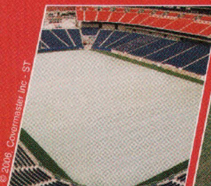
Covers for football and soccer fields are also readily available.