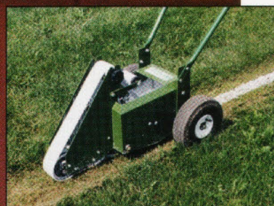
WET LINER: MODEL NO. B-WLM-234

The Bannerman WetLiner is a simple, practical tool for line marking of turf surfaces. Other wet liners spray, while our WetLiner paints each blade of grass to the ground for solid, longer lasting lines. Paint saver roller is available as an option.