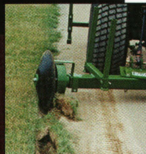
DIAMOND EDGER: MODEL NO. B-DE-20

With its adjustable guide shoe, the Bannerman Diamond Edger is surprisingly easy-to-use. Its three-inch blade depth and reversible, 20-inch concave disc work together to quickly eliminate ridging. Debris is spiraled into the infield for fast and easy clean-up.