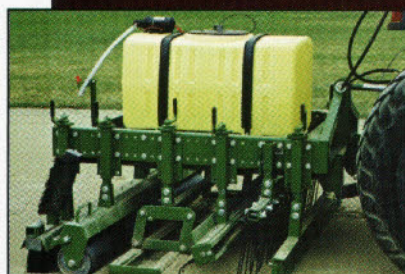
DIAMOND MASTER: MODEL NO. B-DM-6