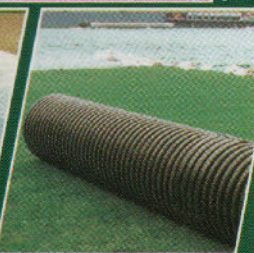
Covers for football and soccer fields are also readily available.