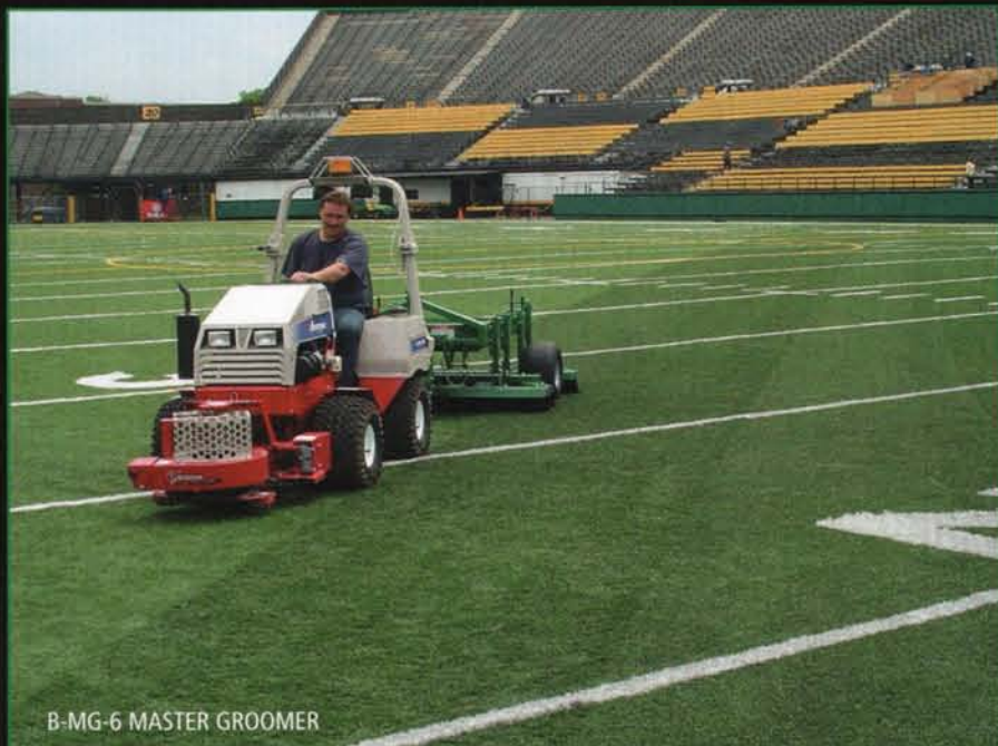
B-MG-6 MASTER GROOMER

New to the Bannerman family of groomers is the B-MG-6 Master Groomer. This brush unit is the "Quick and Slick" answer to working in light to heavy topdressing and other turf building materials down to the base of the grasses, that you've only dreamed of, until now. For use on greens, tees, fairways, and all types of sportsturf surfaces both synthetic and natural.