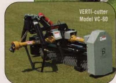
VERTI-cutter Model VC-60

www.1stproducts.com FIRST PRODUCTS, INC.