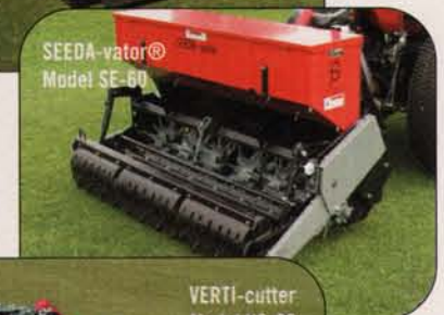
SEEDA-vator® Model SE-60