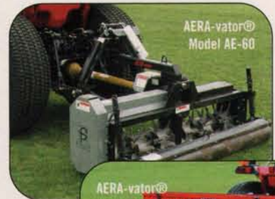
AERA-vator® Model AE-60

Patented swing hitch allows units to turn without tearing the turf.