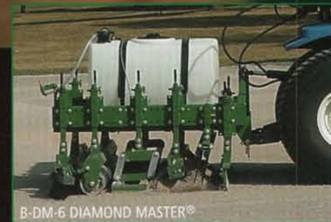
B-DM-6 DIAMOND MASTER

When the safety of your players comes first , look to Bannerman, the leading Groomer manufacturer for over 24 years, to shape, level, and care for your baseball diamonds, warning tracks, and walking/bike trails. The B-BP-4 Ballpark-4® (shown) and the B-BP-6 Ballpark-6®, B-DM-6 Diamond Master® (shown) models have five standard tools, including: Ripper Blade, Rake, Leveler, Roller, and Brush. Accessories available include: Wing Brush Kit, Top Link Kit, 50-gallon Water Tank Kit with spray nozzle, and NEW Highway Transport Kit. Restore your diamond's luster in 20 minutes or less with one of the industry's leading groomers.