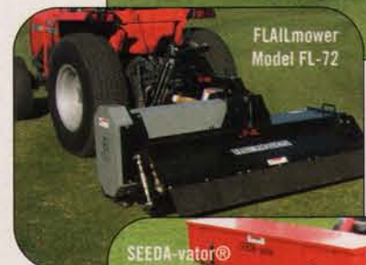
FLAILmower Model FL-72