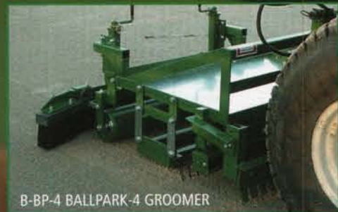
B-BP-4 BALLPARK-4 GROOMER