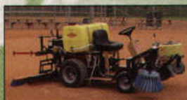
The 8200 – Simply the best "all in one" Athletic Field Maintainer, ever!

"The KROMER'S great design, durable construction and extremely low maintenance has proven to be one of our best purchases...."