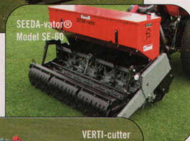
SEEDA-vator® Model SE-60