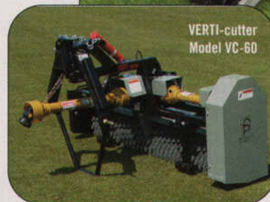
VERTI-cutter Model VC-60

www.1stproducts.com FIRST PRODUCTS, INC.