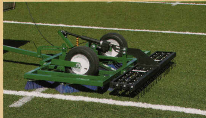
Synthetic Super Duty Blue Brushes Resist wear and will not deteriorate from moisture.

U.S. Patents 5833013, 6655469. Other Patents Pending.