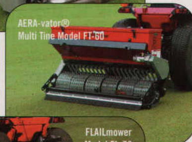
AERA-vator® Multi Tine Model FT-60