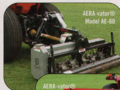
AERA-vator® Model AE-60

Patented swing hitch allows units to turn without tearing the turf.