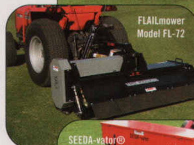
FLAILmower Model FL-72