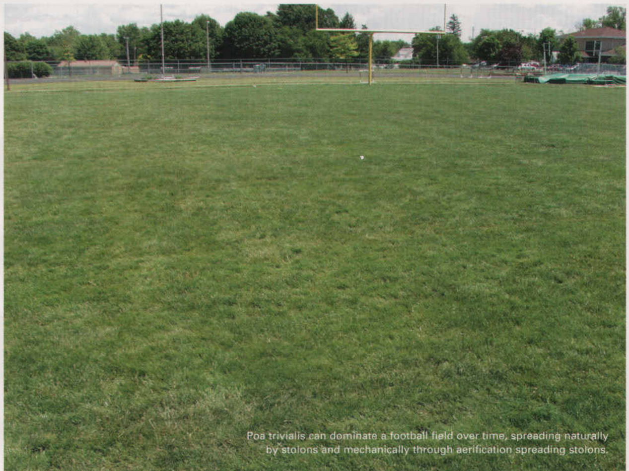
Poa trivialis can dominate a football field over time, spreading naturally by stolons and mechanically through aeration spreading stolons.