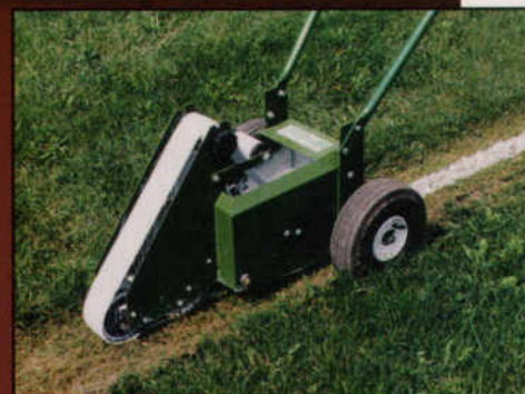
WET LINER: MODEL NO. B-WLM-234

The Bannerman WetLiner is a simple, practical tool for line marking of turf surfaces. Other wet liners spray, while our WetLiner paints each blade of grass to the ground for solid, longer lasting lines. Paint saver roller is available as an option.