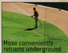
Hose conveniently retracts underground

Above: Edison Field, Home of Anaheim Angels