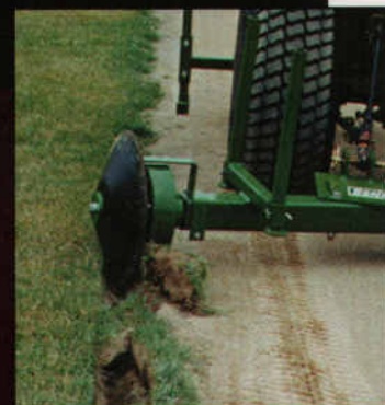
DIAMOND EDGER: MODEL NO. B-DE-20

With its adjustable guide shoe, the Bannerman Diamond Edger is surprisingly easy-to-use. Its three-inch blade depth and reversible, 20-inch concave disc work together to quickly eliminate ridging. Debris is spiraled into the infield for fast and easy clean-up.