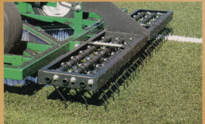
GreensSlicer Spring Tine Rake 3 rows of 28 tines.