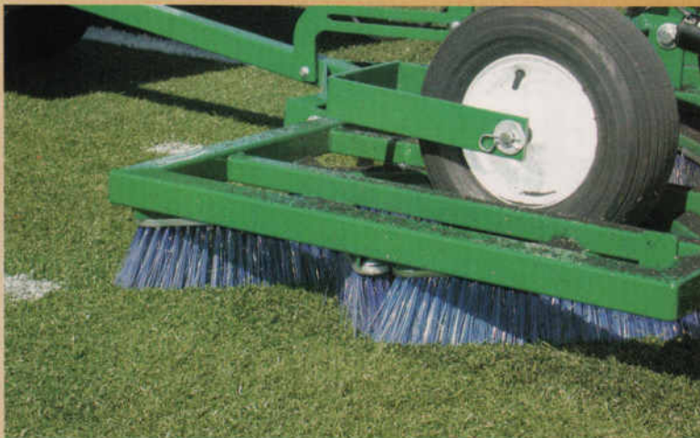
Synthetic Super Duty Blue Brushes Resist wear and will not deteriorate from moisture.