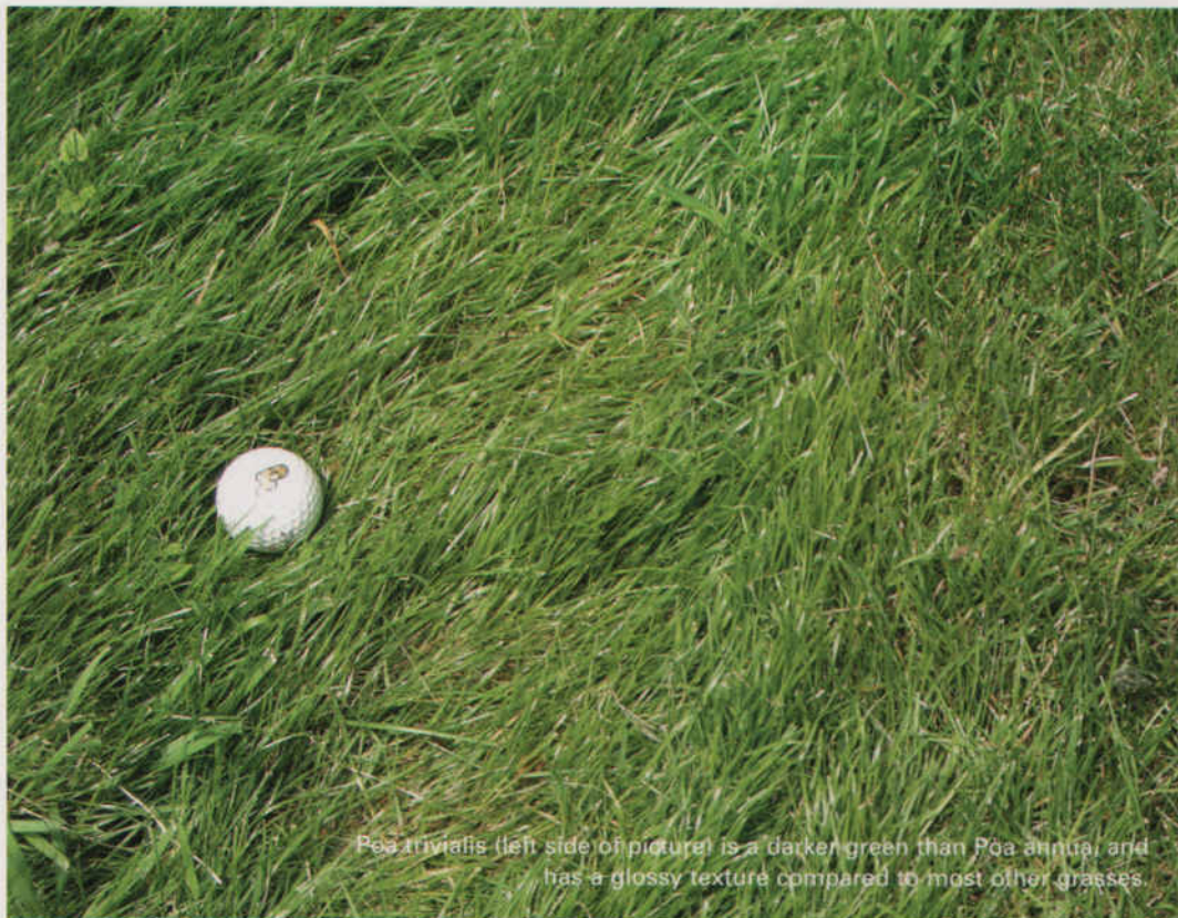
Poa trivialis (left side of picture) is a darker green than Poa annua, and has a glossy texture compared to most other grasses.

preemergence herbicide will prevent it from germinating, but it will not prevent the desired turf from greening-up again. Application timing is important and herbicides must be applied before Poa annua germination (usually in August depending on your location). A second application may be needed in the late fall or early spring to control spring-germinating Poa annua. This technique may take many years to reduce the Poa annua populations and it will not be effective on the perennial type of Poa annua.