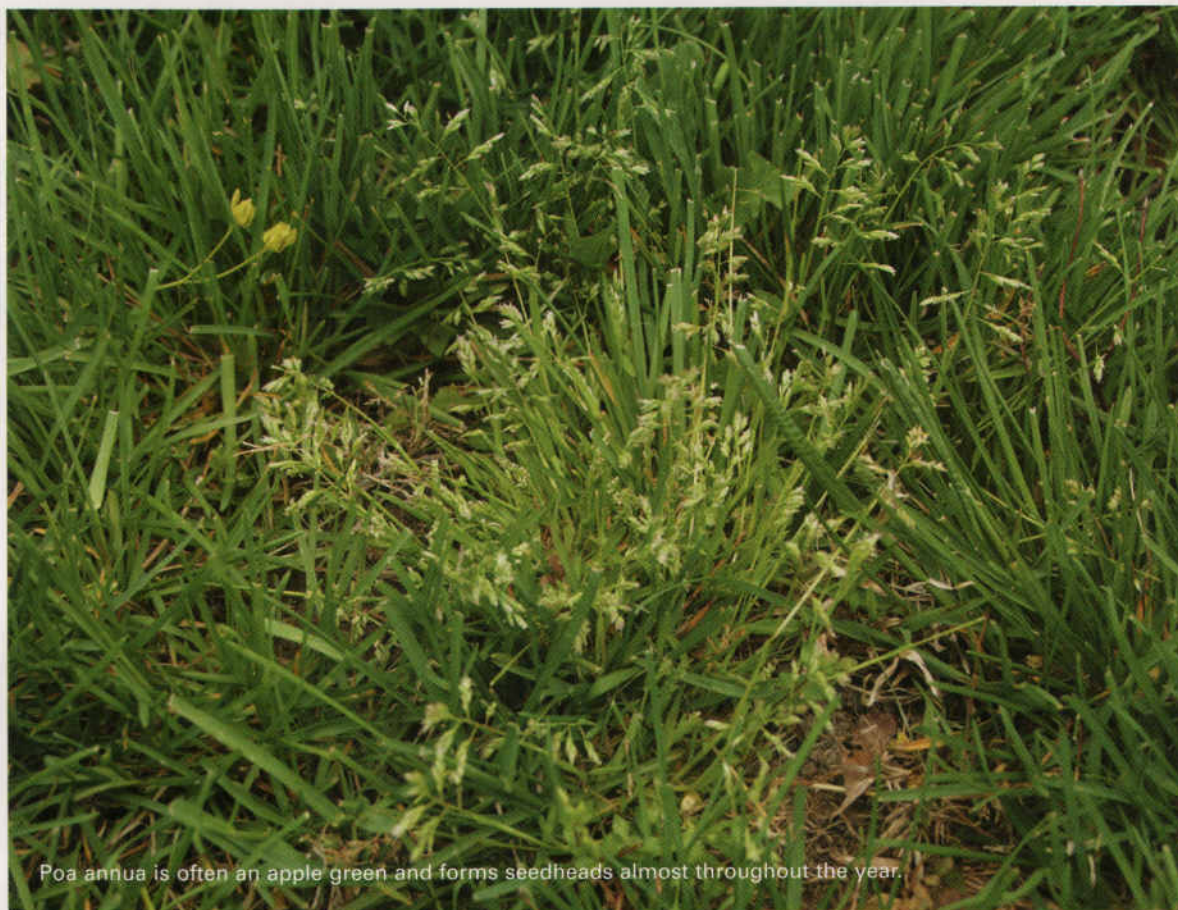
Poa annua is often an apple green and forms seedheads almost throughout the year.

Cultural control of Poa annua in a cool-season turf is almost impossible because some practices required to keep the desired turf healthy will also favor Poa annua . Constant aeration and mowing as high as allowable are two ways to minimize Poa annua infestation. Aerifying during the summer months when Poa annua is not germinating will be most beneficial. Allowing the field to dry out and undergo the first stages of drought stress (bluish green color or footprints that don't