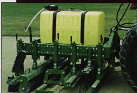
DIAMOND MASTER: MODEL NO. B-DM-6