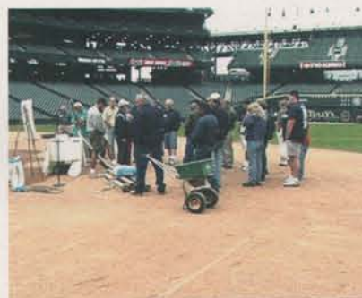
The STMA's new Pacific Northwest Chapter held its inaugural event last August at Safeco Field.