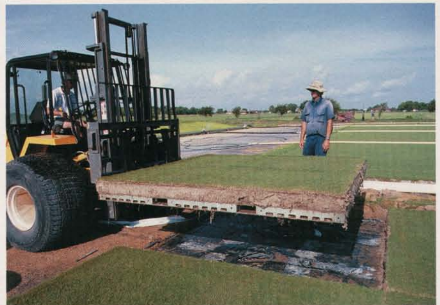
A forklift moves an 8 x 8-ft. module of turf, grown at the Turfgrass America farm in Bay City, TX.