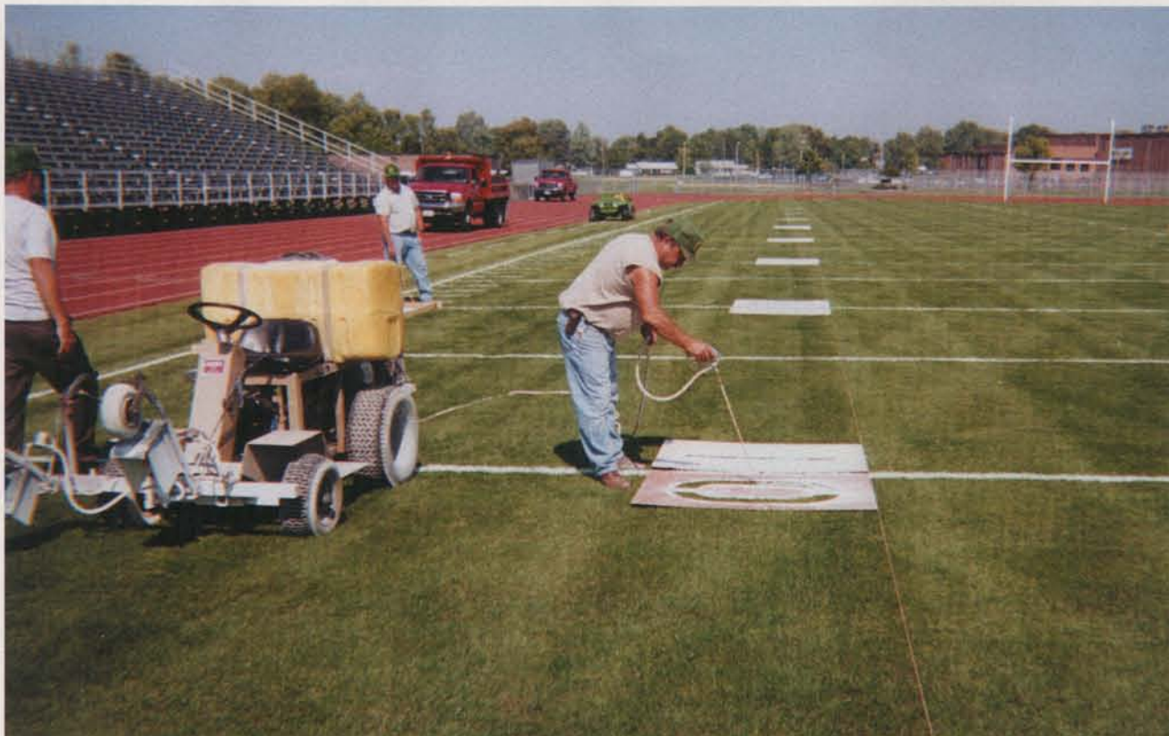
The grounds department is responsible for landscape installation, playground construction, irrigation installations, equipment repair, and snow removal as well as athletic field maintenance district-wide.

Football begins the first week of September and continues through the second week of November, with one to two games per week played on the field. Gaffney says, "Soccer is not played on the stadium game field. We feel that in order to keep the fields in top playing condition, two different sports should not be played on the same field dur-