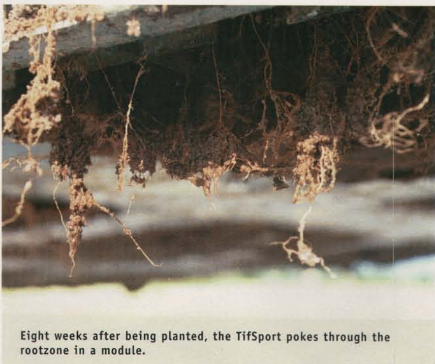
Eight weeks after being planted, the TifSport pokes through the rootzone in a module.