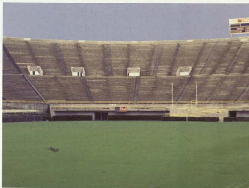
A bermudagrass football field with excellent quality turf, but 2 months away from the first game.

Emergence is the growth of the leaf blade and sheath from their respective growing points until both segments have fully expanded. The function sequence refers to a fully expanded leaf engaged in high photosynthesis (manufacture of plant food) and export of photosynthate (distribution of plant food). Senescence is a leaf growing old with low photosynthesis and no export of photosynthate. Detachment is the death stage with no contribution to plant health. The sequence of leaf emergence to detachment in grass is difficult to visualize because all events occur continually and concurrently among during a short time period (2-4 weeks).