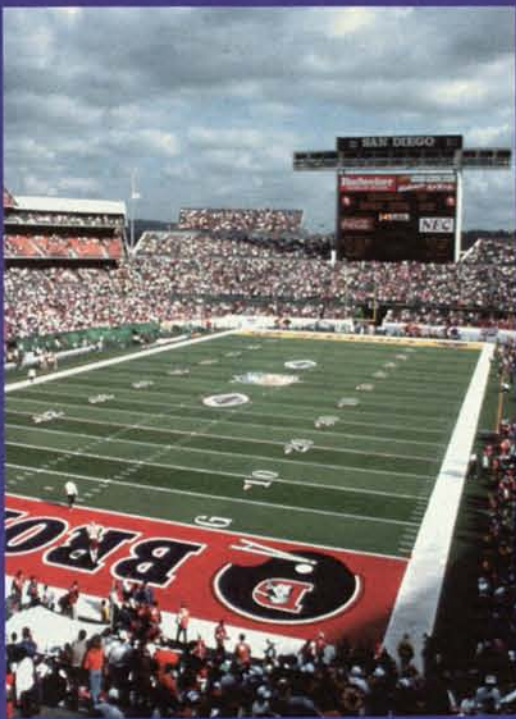
From the Super Bowl to Texas A & M