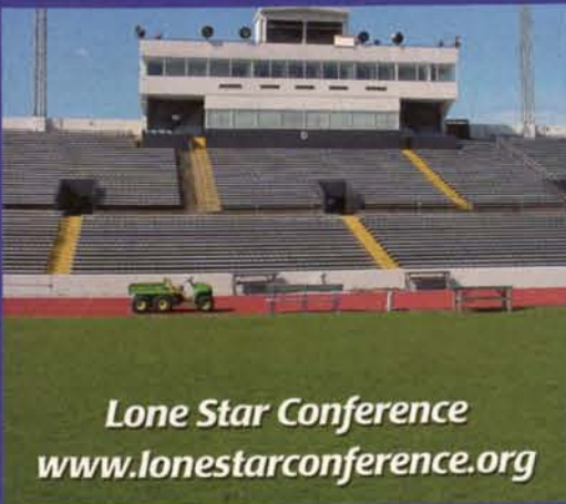
Lone Star Conference www.lonestarconference.org