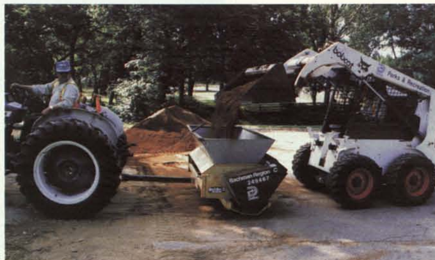
Top-dressing infields can be done fairly quickly and easy with bulk infield conditioners, saving time and money.

skinned area will be too loose. (Note: An overworked infield, or one that is tilled too deep, will take more time and effort to make level and compact.)