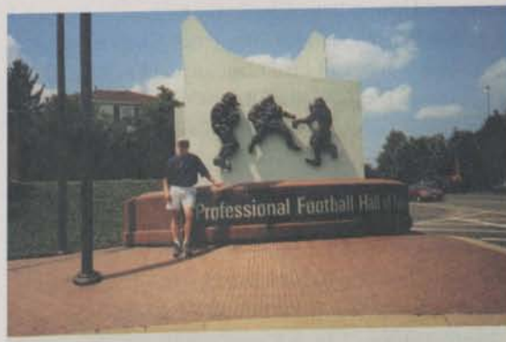
HOF inductees you might meet include George Allen, Dave Casper, Dan Hampton, Jim Kelly, and John Stallworth.