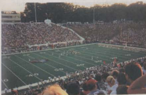
This year's Hall of Fame game in Canton, OH, features the expansion Houston Texans vs. the New York Giants. You could be there!