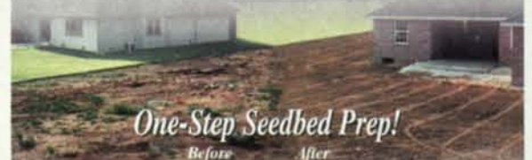
One-Step Seedbed Prep! Before After