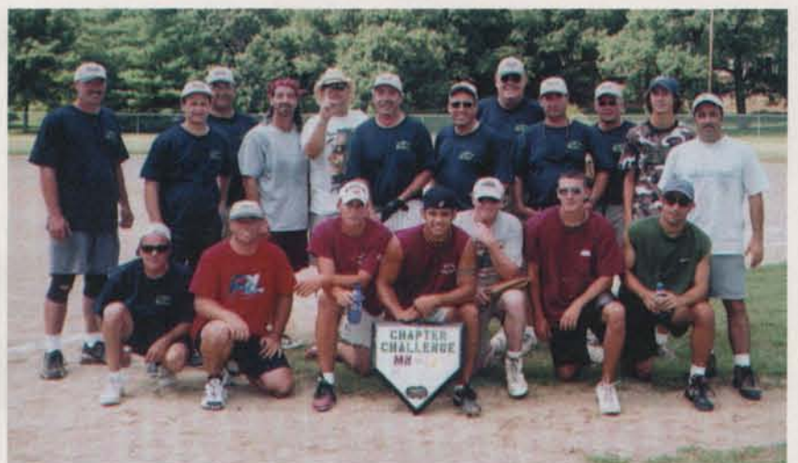
Minnesota/Iowa Chapter Challenge softball participants, post-game. Iowa won 37-7 but the Minnesota Chapter looked better in their matching blue shirts.