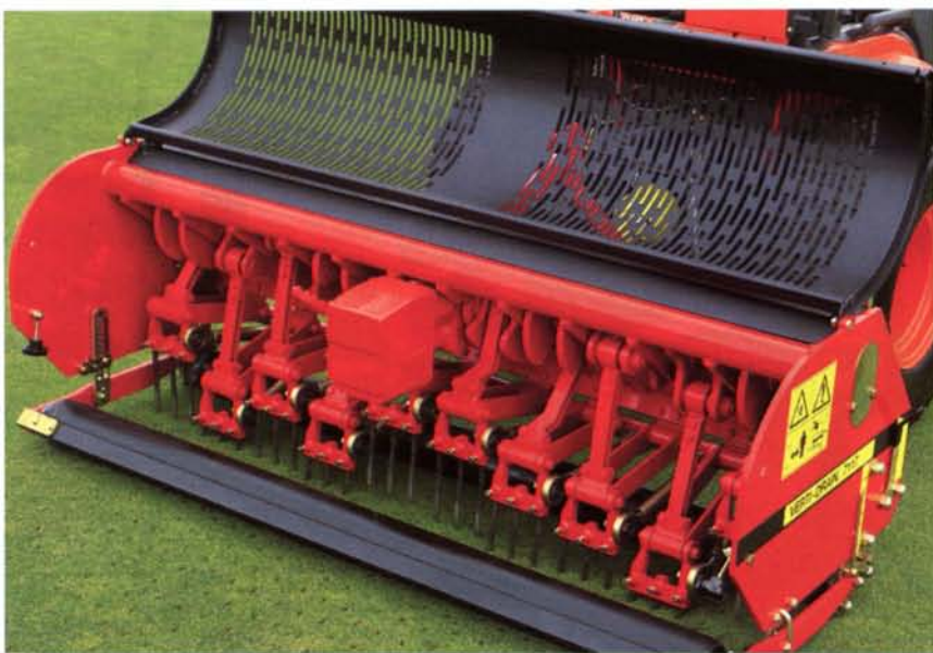
The Wimbledon grounds crew uses the Verti-Drain aerator—which has solid tines for deep tine aeration—during its winter maintenance routine.

During this practice week, the Qualifying Tournament takes place at another facility a few miles away on 16 grass courts, which have all been prepared in a similar manner (including use of the covers) by