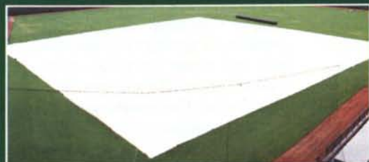
Baseball infield covers come in standard and custom sizes