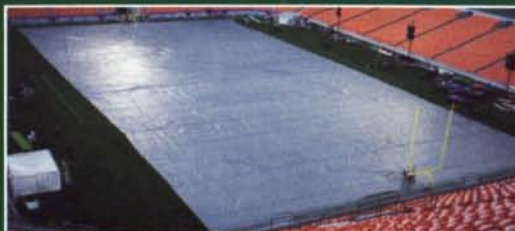
Full size covers for football and soccer are readily available