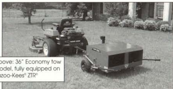
Above: 36" Economy tow model, fully equipped on Yazoo-Kees® ZTR®