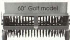
60" Golf model