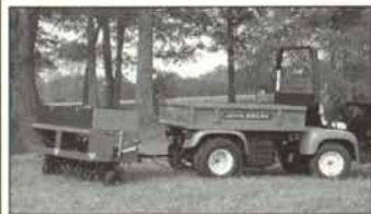
Above: 60" Golf/Sport/Turf tow model with sand weight kit on John Deere® ProGator®

If you would like more information about the various Turf-Aire® models ... call us today!