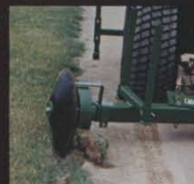
DIAMOND EDGER: MODEL NO. B-DE-20

With its adjustable guide shoe, the Bannerman Diamond Edger is surprisingly easy-to-use. Its three-inch blade depth and reversible, 20-inch concave disc work together to quickly eliminate ridging. Debris is spiraled into the infield for fast and easy clean-up.