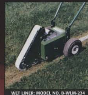
WET LINER: MODEL NO. B-WLM-234

The Bannerman WetLiner is a simple, practical tool for line marking of turf surfaces. Other wet liners spray, while our WetLiner paints each blade of grass to the ground for solid, longer lasting lines. Paint saver roller is available as an option.