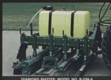
DIAMOND MASTER: MODEL NO. B-DM-6