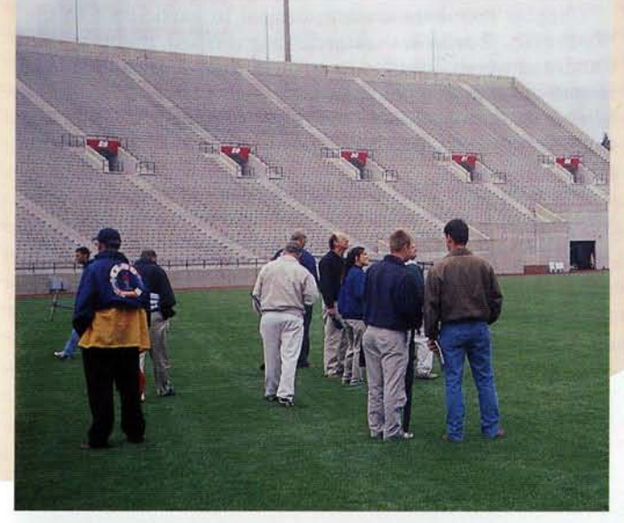
Attendees spread out for an up-close view of the football field at Indiana University's Memorial Stadium.

D riving rain couldn't dampen the spirits of attendees of the Big Ten Regional Workshop. This June event, hosted by Indiana University and the Indiana Chapter of STMA, was held in conjunction with the Big 10 Conference's traditional annual meeting of athletic facility and sports turf managers.