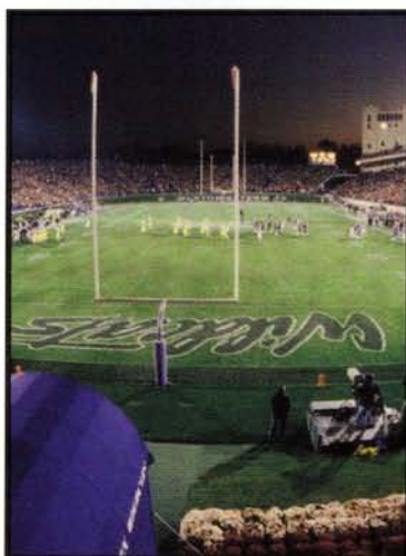
Night shot at a Northwestern University football game. Ryan Field won STMA's College Football Field of the Year.