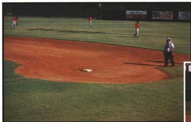
Inside scallops reduce turf tear-out where players make their extra base turns.

A scallop effect around individual bases aids in quality dragging, and leads to fewer low areas where players lead off.