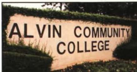
Alvin, Texas Community College