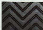
Patented chevron belt design