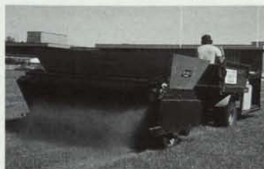
Spread from sand to compost, wet or dry.