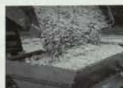
Eliminates shovel loading

You can spot a well-dressed field by how healthy it looks and how even its surface appears. Turfco spreaders assist you leveling out the depressions, restoring the crown, and increasing drainage. They help make a uniform playing field that can reduce injuries. You can top dress one sports field in under 2 hours with just one person to handle both loading and spreading. Request Turfco's Free Sport's Turf Manual on the benefits of top dressing. 3 year warranty standard. To demo our newest model call 612-785-1000.