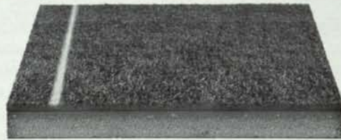
With Top Dressing.