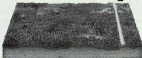
Without Top Dressing.