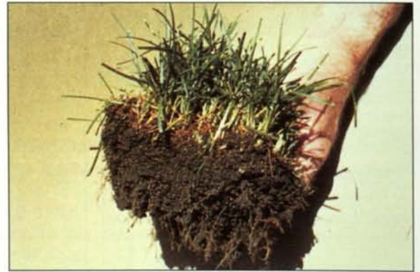
Healthy Turf and Deep Roots (No Mat and Thatch Condition) From Natural Treatment

Call or fax us today for natural solutions to your turf problems. All our natural programs meet or exceed the Federal IPM (Integrated Pest Management) Requirements.