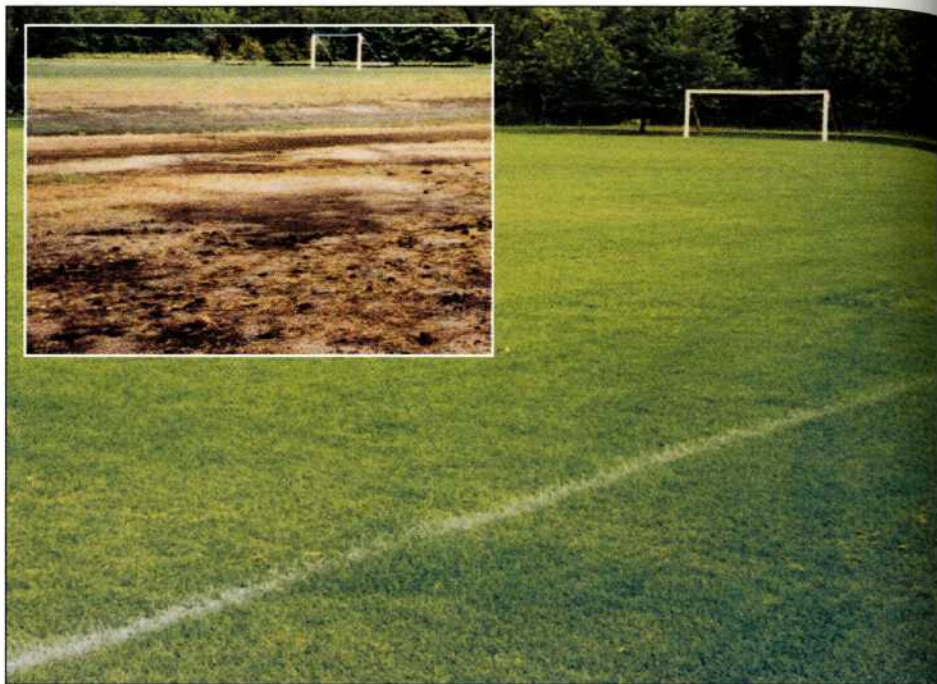
The Sportscore soccer fields suffered substantial turf damage following the torrential downpours that flooded the complex in 1993, but Steve Roser and his staff had the fields back in excellent condition just a few months later.