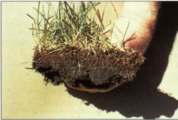
Mat and Thatch Condition From Synthetic Treatment