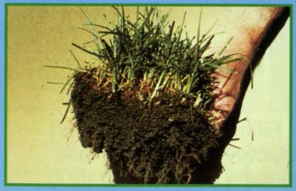
Healthy Turf and Deep Roots (No Mat & Thatch Condition) from Natural Treatment