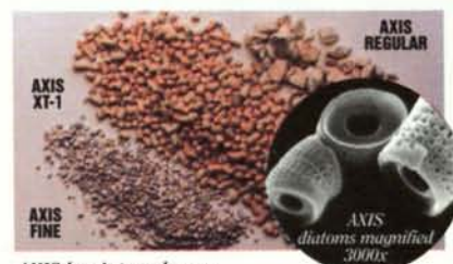
AXIS has internal pores designed by nature to absorb and release water.

AXIS is the only American-made calcined DE soil amendment. It's naturally porous with low bulk