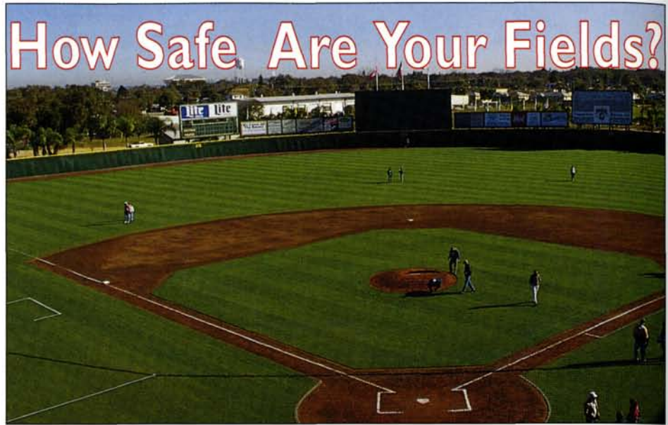
Field construction, maintenance and safety were key topics as STMA members toured McKechnie Field at the 1995 STMA meeting last February in Bradenton, FL.

If, on the other hand, the field is in top