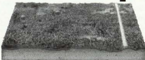
Without Top Dressing.