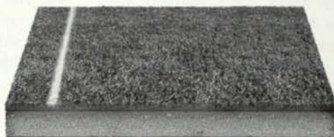
With Top Dressing.