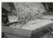
Eliminates shovel loading

You can spot a well-dressed field by how healthy it looks and how even its surface appears. Turfco spreaders assist you leveling out the depressions, restoring the crown, and increasing drainage. They help make a uniform playing field that can reduce injuries. You can top dress one sports field in under 2 hours with just one person to handle both loading and spreading. Request Turfco's Free Sport's Turf Manual on the benefits of top dressing. 3 year warranty standard. To demo our newest model call 612-785-1000.