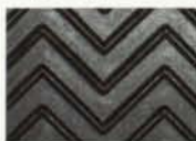
Patented chevron belt design