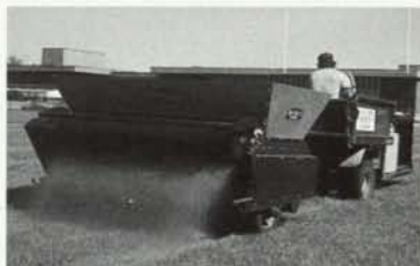
Spread from sand to compost, wet or dry.