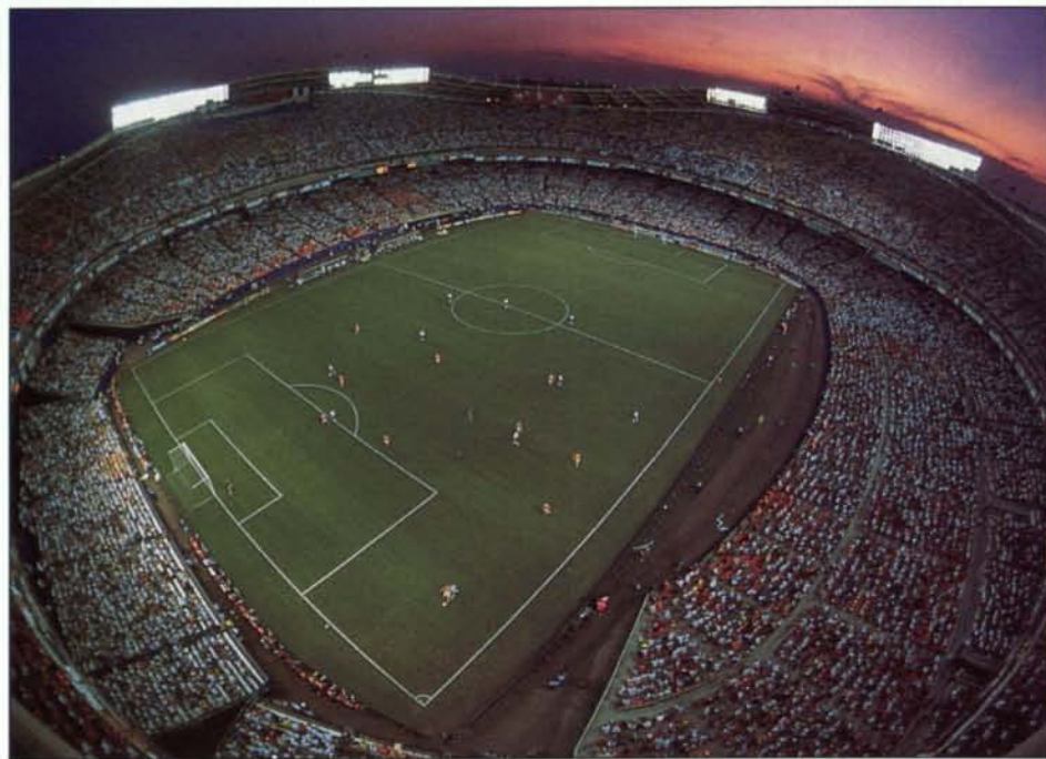
Bermudagrass sod brought in on May 15 provided a perfect playing surface for World Cup soccer in late June.

"And I got so caught up in the job and loved it so much that I never left," he enthuses.