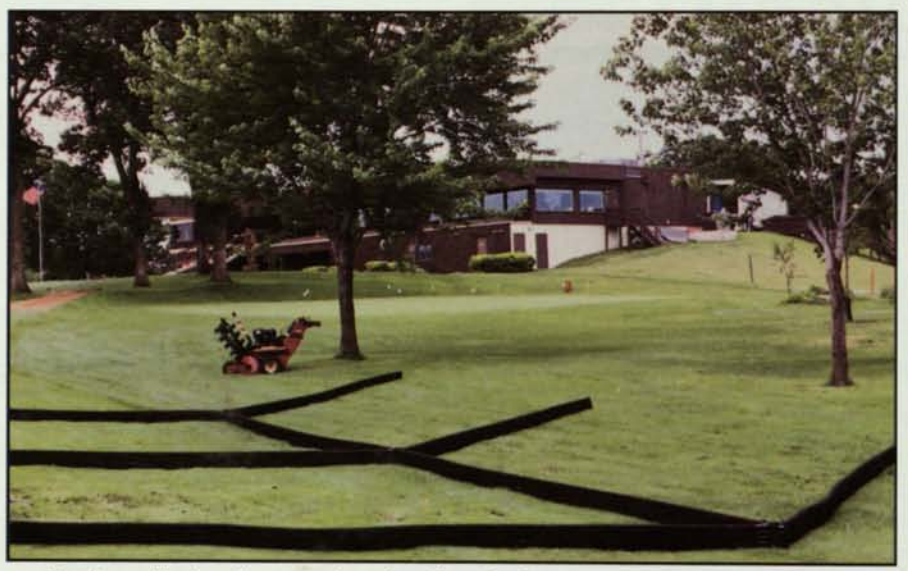
Pre-installation layout showing herringbone pattern—one of many configurations possible with Multi-Flow's exclusive connecting system.