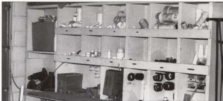
Irrigation parts should be stored separate from the equipment parts inventory.

The chemical storage area needs to be separate from other portions of the maintenance facility. The area must have locked doors to restrict entrance. Shelving is important for keeping small containers of chemicals separated and orderly. Larger containers should be stored on concrete floors.