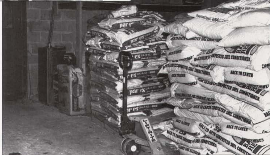
A well-designed fertilizer storage area. Fertilizer is kept off the floor and forklift access is easy.

As operations slow for the winter, the off months are the perfect time to put full-time employees to work reorganiz-