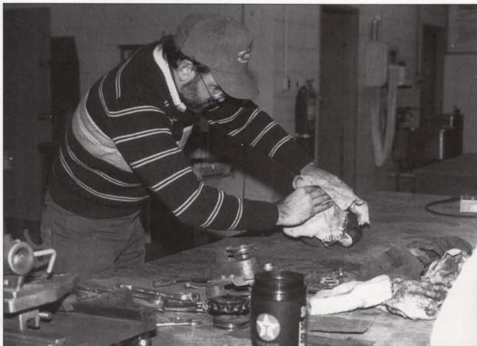
A sturdy, spacious workbench is a must for the mechanic's work station.

As a golf course superintendent or sports turf manager, you might spend as much as one third of each work day based out of your maintenance building. How you set up your shop not only makes you more efficient, but also reflects what you expect from your employees.