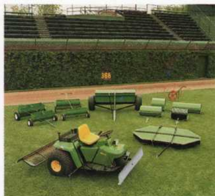
Attachments such as seeders, spreaders, brushes, blades, scarifiers and rakes help the 1200 work productively on any ball field.

"It's got tremendous power. We can push or pull implements through heavy, wet clay without