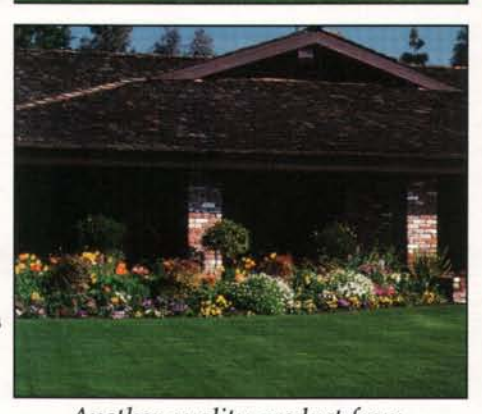
Another quality product from...