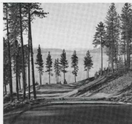
Hillside holes have view of Lake Coeur d'Alene.