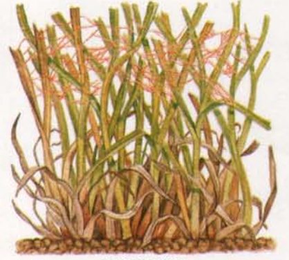
SNOW MOLD: 4 oz./1,000 sq.ft. applied late fall.