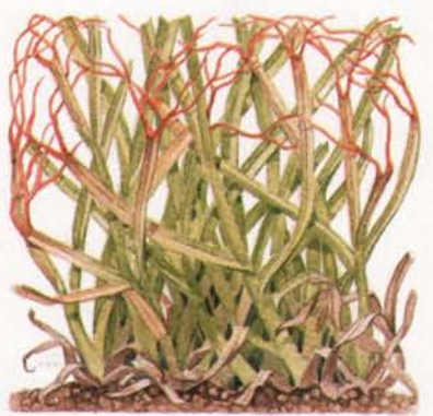
RED THREAD: 2 oz./1,000 sq.ft. every 14-21 days.