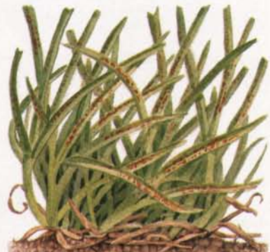
RUST: 1-2 oz./1,000 sq.ft. every 14-28 days.