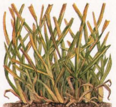
ANTHRACNOSE: 1-2 oz./1,000 sq.ft.every 14-28 days.

POWDERY MILDEW: 1-2 oz./1,000 sq.ft. every 14-28 days.