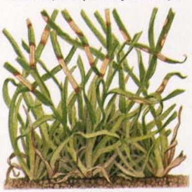
DOLLAR SPOT: 1 oz./1,000 sq.ft. every 28 days.

Only Banner<sup>®</sup> lets you prescribe just the right preventive treatment for so broad a spectrum of turfgrass diseases. For even more helpful information, contact your turf products distributor.