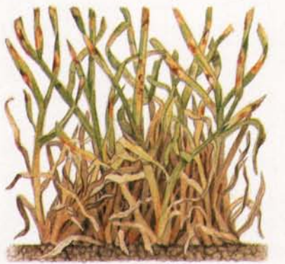
SUMMER PATCH: 4 oz./1,000 sq.ft. applied April-June, or according to local recommendations.