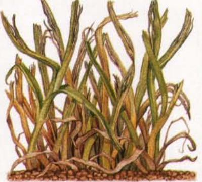
STRIPE SMUT: 1-2 oz./1,000 sq.ft. applied late fall or early spring.