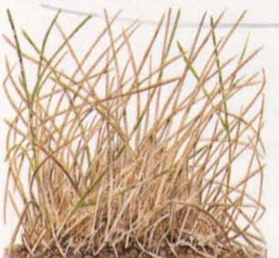
BROWN PATCH: 2-4 oz./1,000 sq.ft. every 10-21 days.