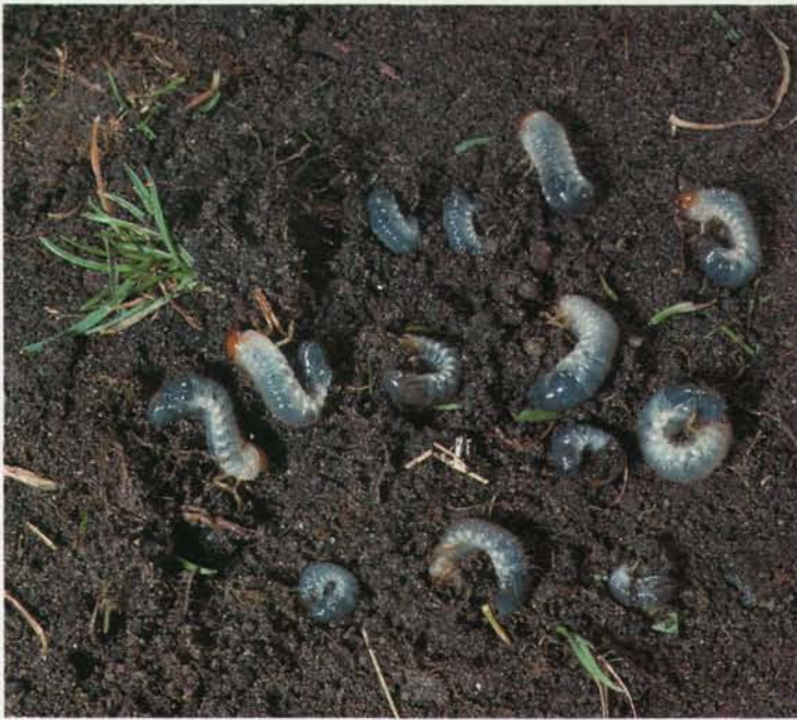
White grubs found when sod was pulled back.