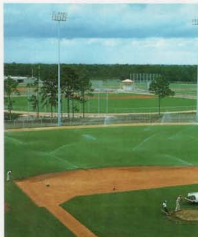
New York Mets Training Facility, St. Lucia, Florida

And remember, the whole team is backed by a full five-year, no-questions-asked exchange warranty.