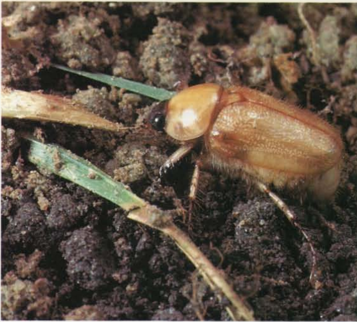
Adult June beetle.

There is no current method for effective control of the ground pearl. Not even fumigation has stopped brown, damaged spots from getting larger each year.