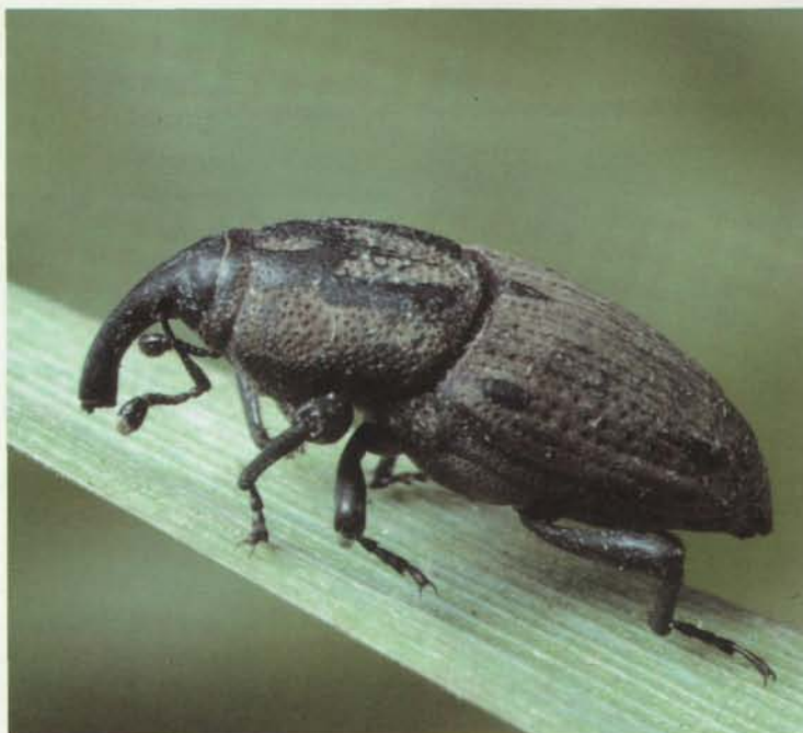
Adult billbug.