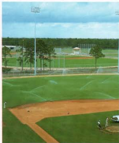
St. Lucie County Sports Complex, Florida

And remember, the whole team is backed by a full five-year, no-questions-asked exchange warranty.