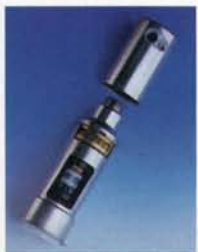
A rugged stainless steel case protects the nozzle and drive assembly.

Compare these stats: The 640 body is twice as heavy as many other brands, making it more resistant to vandals as well as to surges and water hammer. Critical gears are high-impact brass.