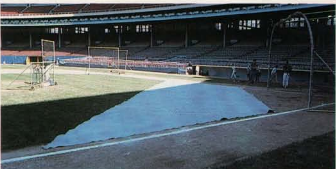
TerraCover™ Bench Tarp for Bench Areas, Infield Areas, etc.

Finally . . . here's a solution for protecting turf against damage from the cleats of football and soccer players, coaches and others moving along sidelines and in team bench areas. Keeps coaches and players cleaner, dryer and happier.