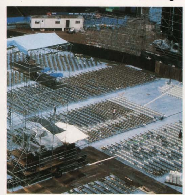
TerraCover™ . . . for entire Sports Fields and Stadium Turf Areas

It breathes naturally . . . assures free passage of oxygen, carbon dioxide, water and some sunlight so turf stays healthy, beautiful and green.