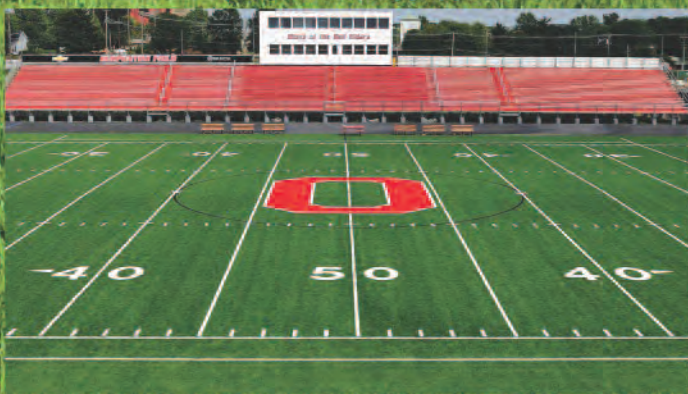
ORRVILLE HIGH SCHOOL