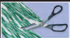
Can be cut or shaped without fraying thanks to Smart Edge Technology™