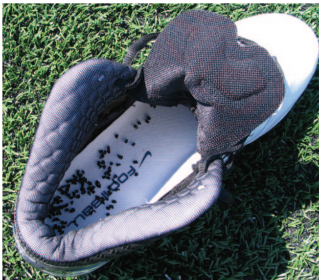
>> Top: A FIREPROOFING DEPTH GAUGE is a good tool to measure infill depth and can be purchased for less than $15.