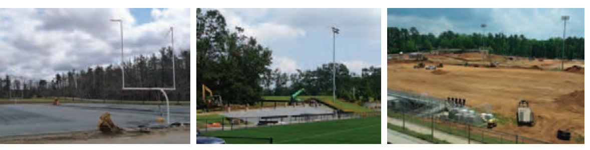
Above and middle

e've all done it: sat across the conference table from someone in business and thought, "This would be a lot easier if the other person only (fill in the blank with a specific task you wish the other person would do)."