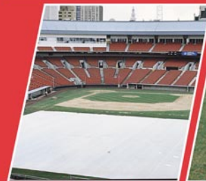
Covers for football and soccer fields are also readily available.