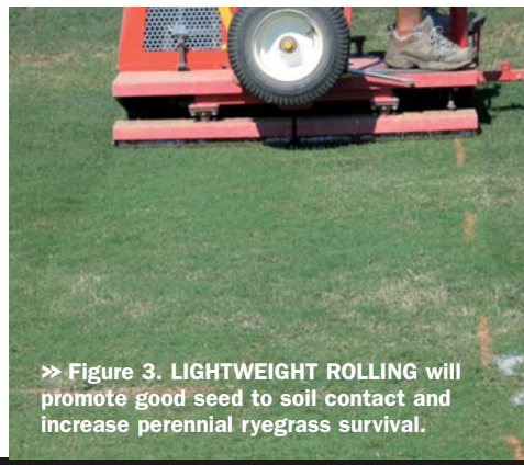
» Figure 3. LIGHTWEIGHT ROLLING will promote good seed to soil contact and increase perennial ryegrass survival.

I N THE TRANSITION ZONE fall means two things: football and overseeding bermudagrass athletic fields. Overseeding protects the dormant bermudagrass from the deleterious effects of traffic stress during fall and spring (Figure 1). Research at the University of Tennessee has found that overseeding can increase the number of games a field will maintain acceptable (>70%) cover by up to as much as 23%. While there are numerous benefits to overseeding, athletic field managers should consider several things before moving forward with an overseeding project.