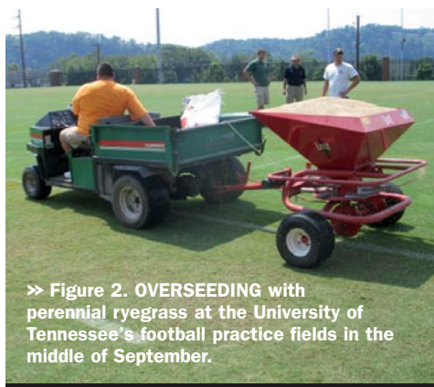
» Figure 2. OVERSEEDING with perennial ryegrass at the University of Tennessee's football practice fields in the middle of September.