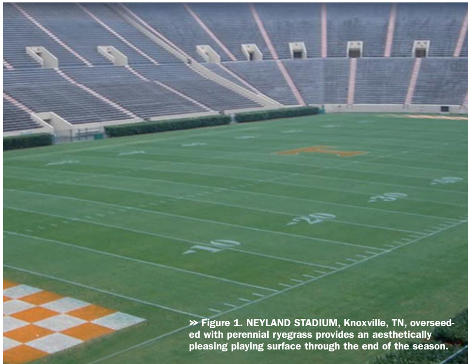
» Figure 1. NEYLAND STADIUM, Knoxville, TN, overseeded with perennial ryegrass provides an aesthetically pleasing playing surface through the end of the season.