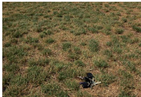
Figure 4. Clumpy ryegrass can be both unsightly and a potential safety hazard on athletic fields

Historically, older cultivars of perennial ryegrass could not withstand summer temperatures in Tennessee and would naturally be eradicated during the early summer as temperatures increased. However, perennial ryegrass breeding efforts have led to the development of heat-tolerant cultivars that can perpetuate during the Tennessee summer heat. This is problematic, as research has shown