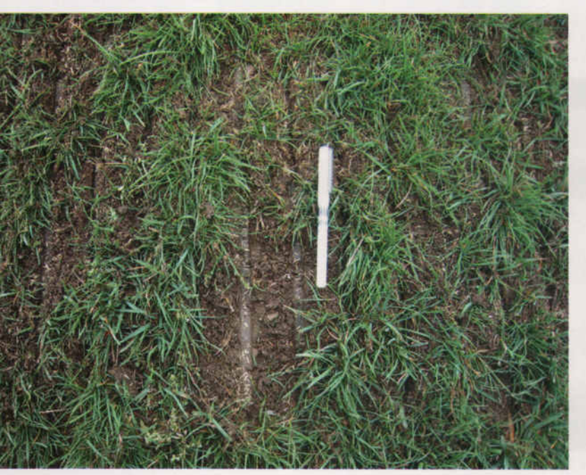
Before and after seeding with TriWave in New York State

Minner continues to study seeding rates and estimates that 50% of seed applied typically never makes a successful plant. "No wonder that higher than normal seeding rates are needed before gains in turf cover are realized when seed is applied during traffic," he says.