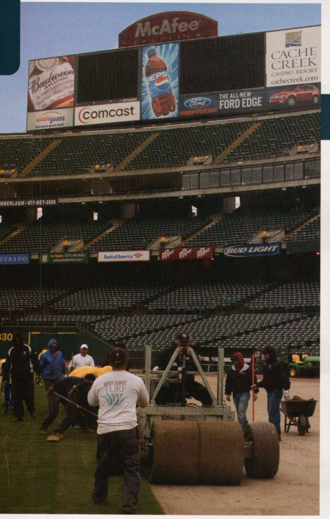
West Coast Turf crew installs big rolls of certified TifSport bermudagrass at McAfee Coliseum in Oakland, home of the Athletics and Raiders.