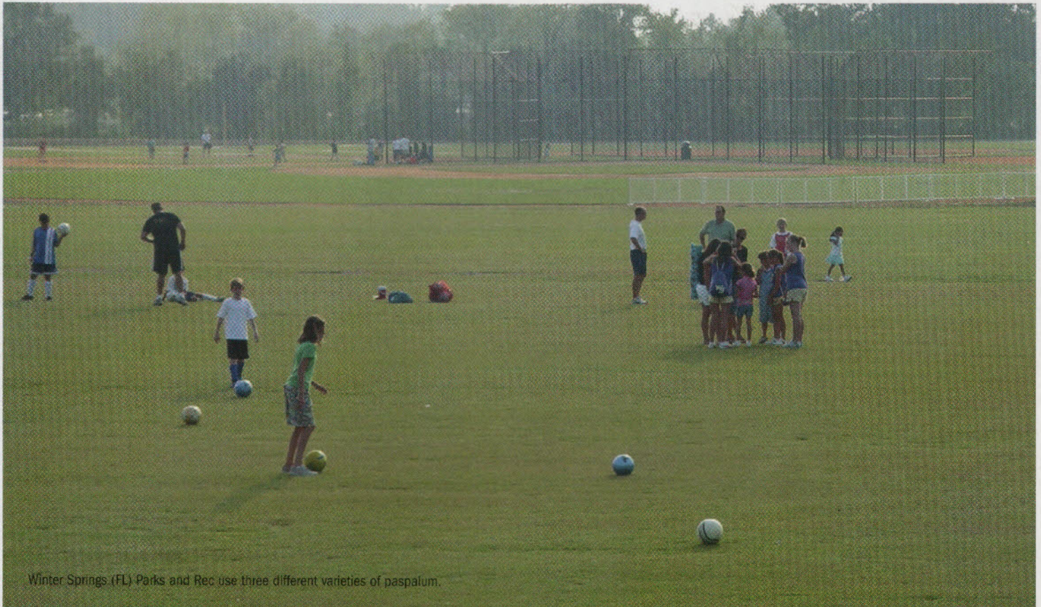
Winter Springs (FL) Parks and Rec use three different varieties of paspalum.