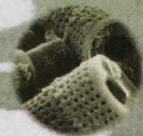
Diatomaceous Earth Magnified 3000X